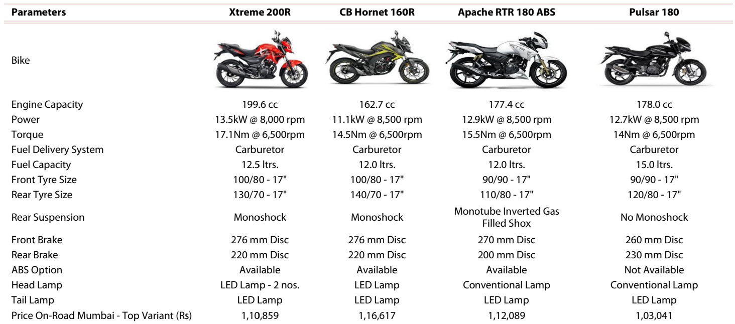
Exhibit 1: Comparison of Xtreme 200R with 150cc-180cc bikes (at similar price point)