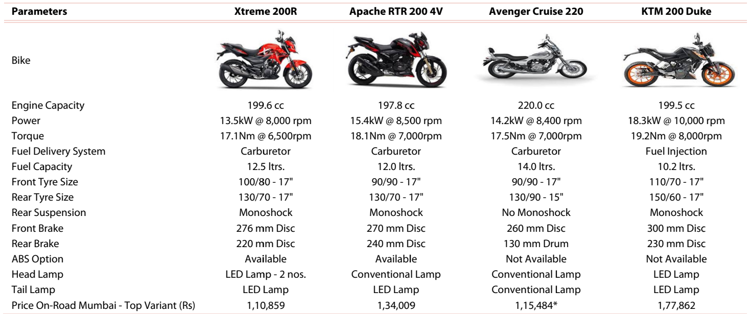
Exhibit 2: Comparison of Xtreme 200R with similar cc bikes, peers are 20%-60% costlier