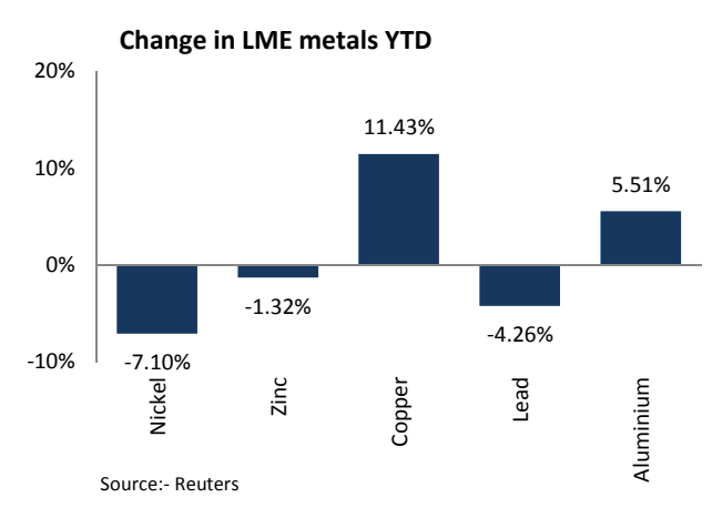
"2021 may prove to be a transformation year for copper. Inflation expectations are rising, while global economic growth is recovering, with Chinese demand in particular coming back online at a rapid pace."