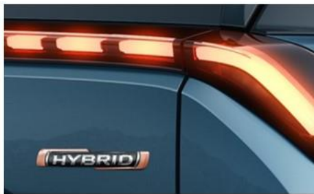
Strong Hybrid powertrain with EV mode