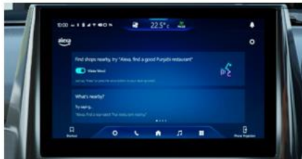
10.1 inch SmartPlay Pro X infotainment system