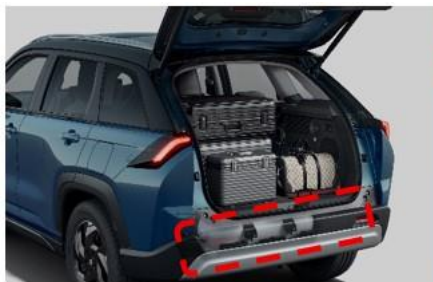
S-CNG with a new underbody tank design