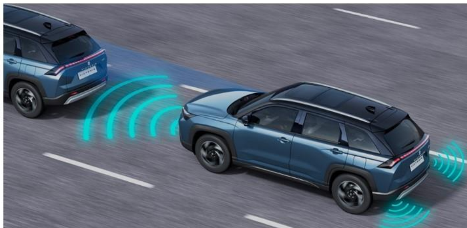
Advanced Level 2 ADAS system offers 10+ intelligent driver-assist features

Engineered for superior safety, the VICTORIS integrates a comprehensive suite of modern active safety technologies that include: