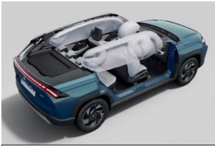
6 airbags as standard

Underscoring MSIL's commitment to offer enhanced safety for customers across all passenger vehicle segments, the Maruti Suzuki VICTORIS is equipped with the ARENA Safety Shield. Consisting of an array of standard safety features, the ARENA Safety Shield includes 6 airbags, Electronic Stability Program 2# (ESP®), Anti-lock Braking System (ABS) with Electronic Brakeforce Distribution (EBD), Hill Hold Control, Reverse Parking Sensors, 3-Point seat belts and seat belt reminder, along with 3 years or 1 00 000 km warranty 3# for added peace of mind.