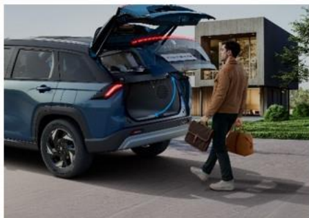
Smart powered tailgate with gesture control