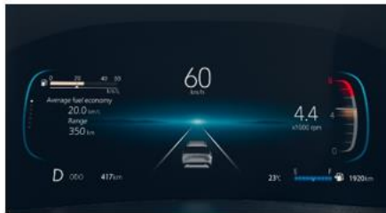
10.25 inch fully digital instrument cluster