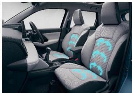
Ventilated front seats

The VICTORIS offers reimagined comfort by blending convenience, personalisation, and intuitive design into everyday driving for today's boldly expressive youth with: