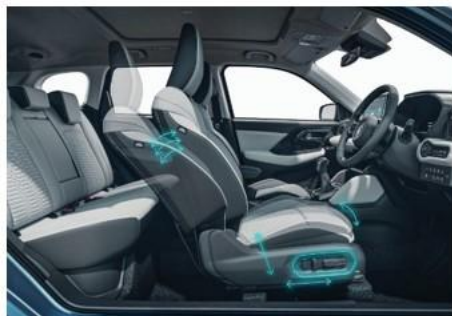
8-way electrically adjustable driver seat