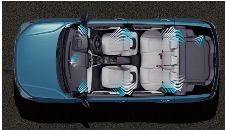
8-speaker Premium Sound Experience – Infinity by Harman integrated with Dolby Atmos 5.1 Surround Sound

With cutting-edge digital integration, VICTORIS becomes an extension of the 'Always Online, Always On The Move Lifestyle'. The sophisticated interiors of the VICTORIS feature a suite of intelligent technologies, developed for a connected and immersive experience.