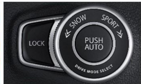
ALLGRIP Select with Multi-Terrain Mode Selector

Celebrating the unique needs of the new age customer, the All-New VICTORIS is a multi-product offering with a wide range of powertrain, and transmission choices for customers. The VICTORIS offers compelling power, efficiency, and versatility through its diverse range of drivetrain systems: