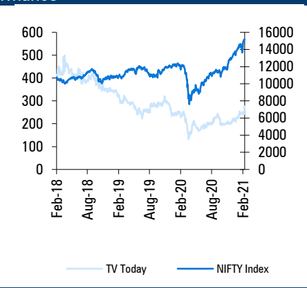
Exhibit 6: Price Performance